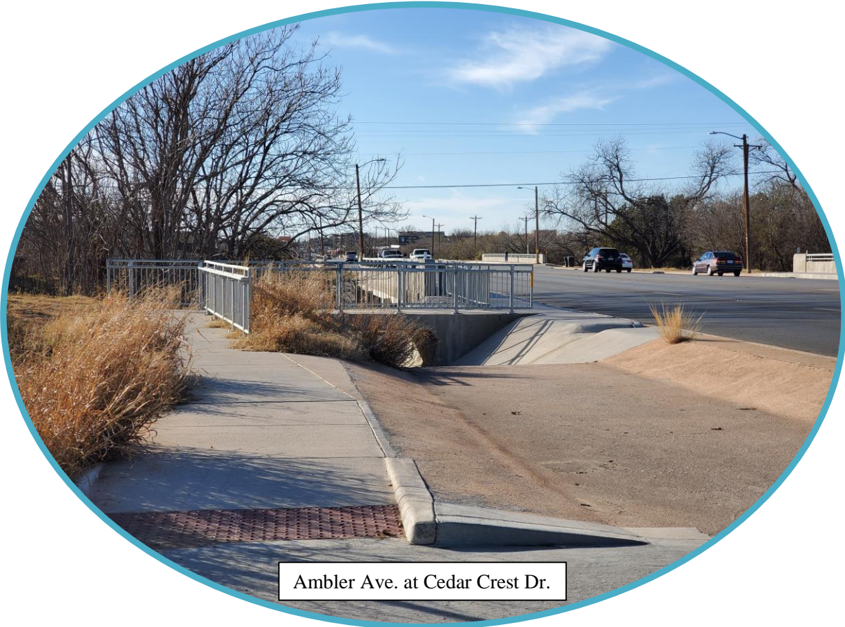
Ambler Ave. at Cedar Crest Dr.

From October 1, 2021 to September 30, 2022